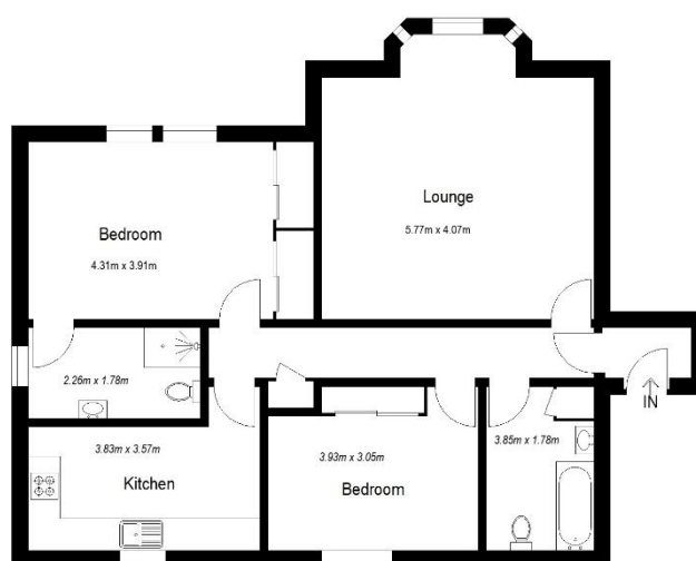
Illustration For Identification Purposes Only. Not To Scale (ID1234389 / Ref:91251)

This is a fantastic opportunity to purchase a property in a residential area and viewing is highly recommend.